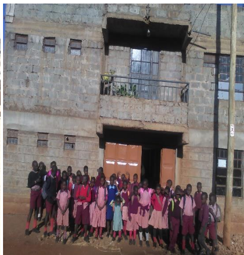
Our new school