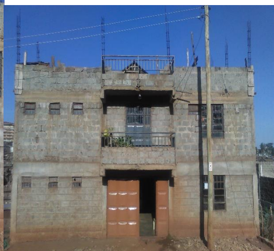
Our incomplete building